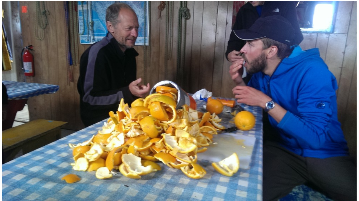
The Battle of Tang Mountain completed.