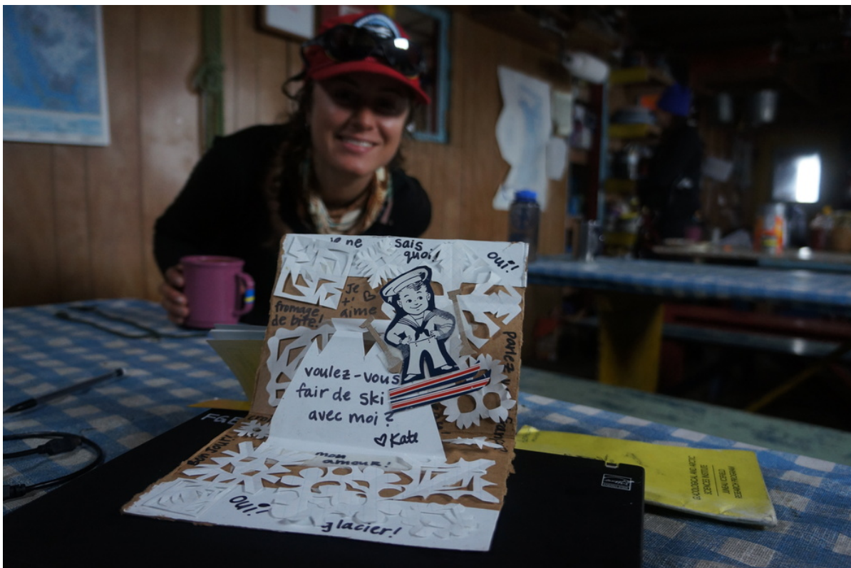
It was Surprise Postcard night

Also doing our time at Camp 17 one of our safety staff members had an idea to build a tarp fort around the fireplace and shared many different stories. It was a wonderful bonding time. Lastly, we took our trail apples and made delicious apple pies that we ate for the next couple of days. So, while we were anxious to get to Camp 10 we had a wonderful time at Camp 17.