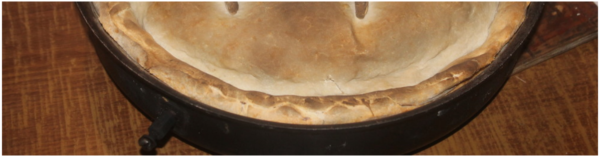
Our Trail Apple Pie